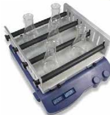
400.101.150 Pictured with 400.101.157 Universal Platform & Flasks all sold separately