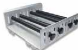
400.102.112 / 157 Universal Rack